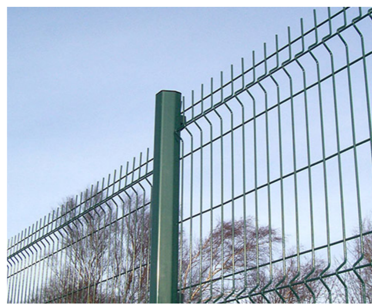
Metal Wire Mesh Fencing