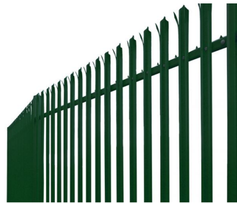
Metal Palisade Security Fencing