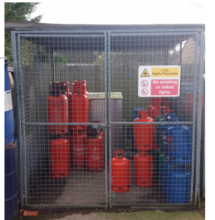
Gas bottle chambers

Please read in conjunction with Andrew Hastings Landscape Consultants Ltd drawing No. 17.3038.01